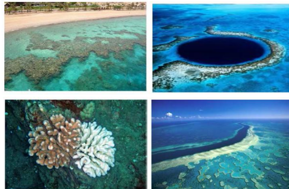
Fig. 1. (a) Fringing reef off the coast of Eilat, Israel. (b) The Great Barrier Reef, Australia. (c) Lighthouse Atoll Reef, Belize. (d) Coral Bleaching

which will boost the demand for data storage and processing automation.