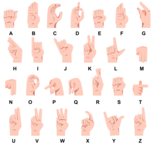
Fig. 1. American Sign Language

It is crucial to recognize that sign language exhibits significant regional variations influenced by cultural factors. Unlike universal sign language, sign languages have naturally evolved within specific communities, resulting in a plethora of distinct variants. Presently, there exist approximately 138 to 300 different sign languages worldwide [5]. For example, Indian Sign Language (ISL), for example, is widely used in India, whereas American Sign Language, or ASL, is used in the United States and Chinese Sign Language (CSL) is used in China. Sign language is a comprehensive communication system that conveys message through hand types, body posture, and facial expressions. Each gesture has its own importance.